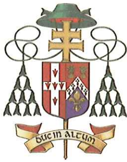
Office of the Archbishop

ARCHDIOCESE OF OKLAHOMA CITY P.O. Box 32180 OKLAHOMA CITY, OKLAHOMA 73123 405.721.5651 pcoakley@catharchdioceseokc.org